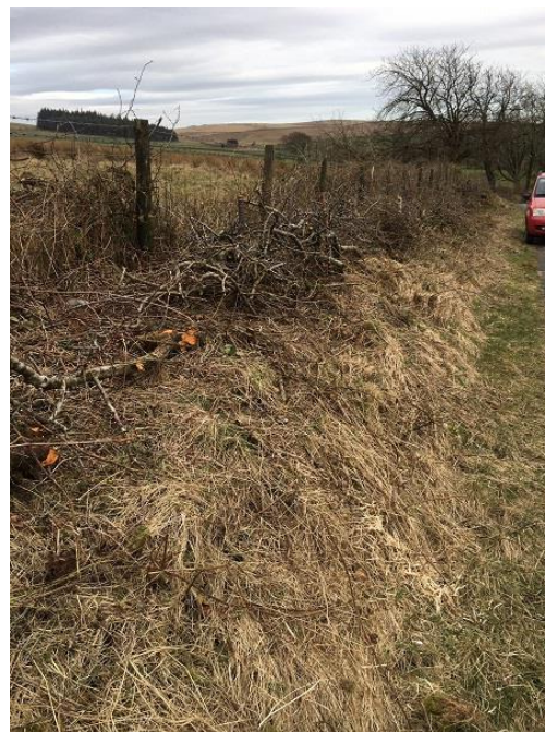
The roadside hedge at Mountain Farm before (left) and after laying (right) ready to be re-planted

Match funding to the value of £6649 has been brought into the project this year with evidence of walling and hedgerow restoration spend via Countryside Stewardship funding. This was on two farms within the PH Farmer Network (Cobden Farm and Old Hall Farm) and comprised the following work: