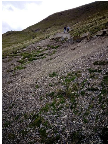
Adding new drains to the lower path, and the erosion of the zig zag section prior to work starting April 2021