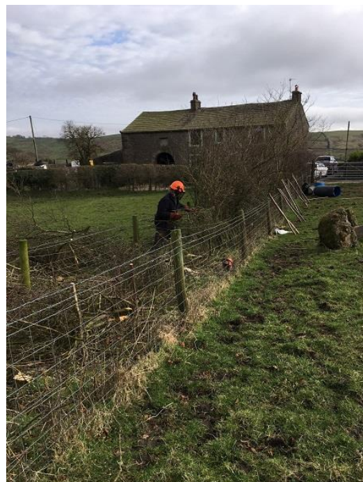
The hedgerow at Sabden Fold farm before restoration (left) and during the laying work (right)