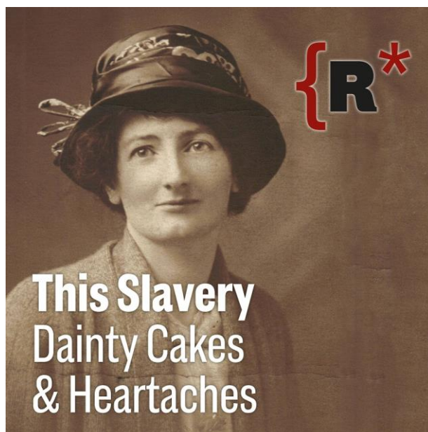
The first two 'This Slavery' podcasts