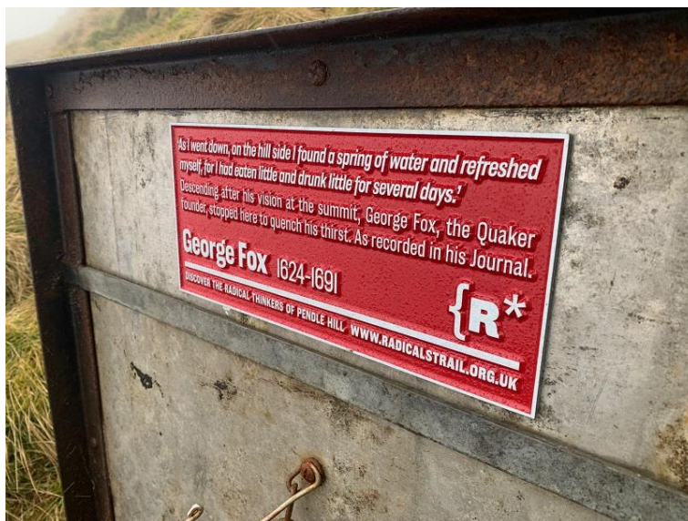
The plaque installed inside the lid to Fox's Well, the plaque at the shelter is show on the front cover

After the Zoom events, the Radicals Research Team on Facebook received a flurry of new recruits and has leapt up to 78 members.