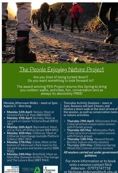
Green social prescribing activity leaflets (left) and the new PEN sessions poster

These booklets have been distributed to local social prescribers, community connectors, NHS services and via wider partners and organisations who are still retaining some contact with individuals. Digital versions are also available through our website https://www.pendlehillproject.com/explore-learning and have been shared on social media. These booklets will hopefully be utilised and shared throughout the rest of the project.