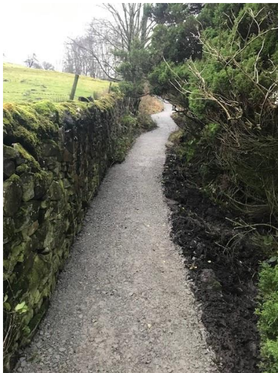
New footpath link at Barley car park wildlife site

On Pendle Summit the delivery of the additional Summit Revisited work suffered from supply chain delays in Q4. The geo-textile was delayed in transit and this work (together with the remaining 20 x 3 and 4m timber dams) has now been completed during the first two weeks of Y4Q1.